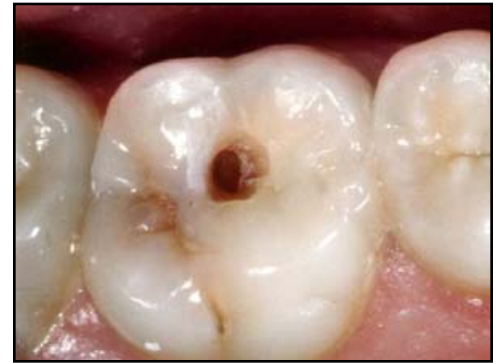
A visible cavity

The widespread use of fluoride to fight cavities has been the greatest breakthrough in the past fifty years of preventive dentistry. Fluoride can help prevent cavities by actually hardening the outer enamel layer of teeth, and it can even stop or slow down the growth of pre-existing cavities.